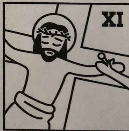
11 th Station: Jesus is crucified.