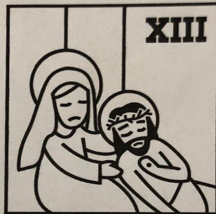
13 th Station: The body of Jesus is taken down from the cross.