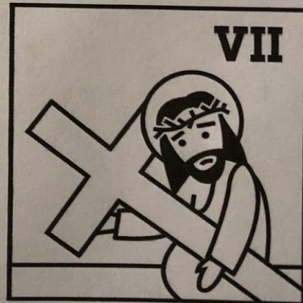
7 th Station: Jesus falls the second time.