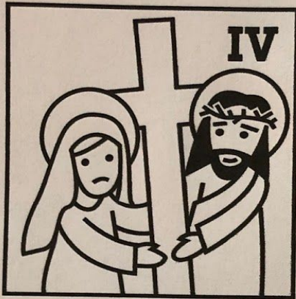
4 th Station: Jesus meets his mother.