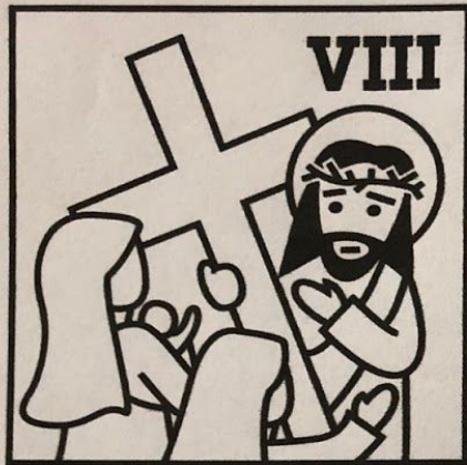
8 th Station: Jesus meets the women of Jerusalem.