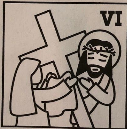
6 th Station: Veronica wipes the face of Jesus.