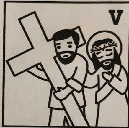
5 th Station: Simon of Cyrene helps Jesus carry his cross.