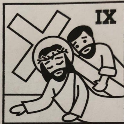
9 th Station: Jesus falls a third time.