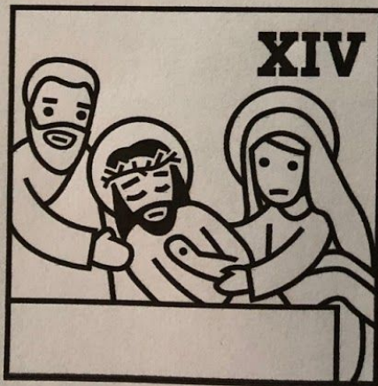
14 th Station: Jesus is laid in the tomb.