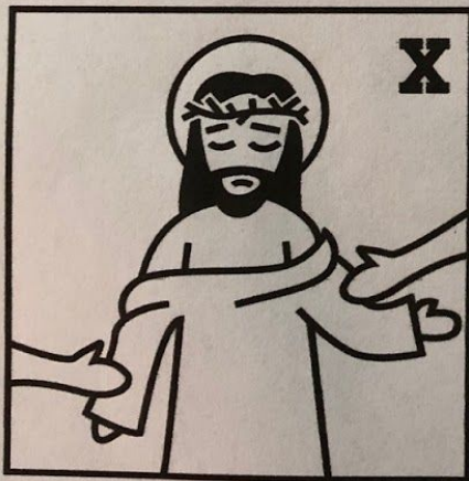
10 th Station: Jesus is stripped of his clothes.